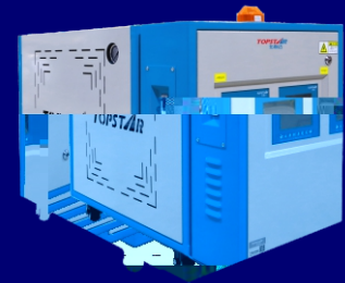
Multi-purpose water type mold temperature controller